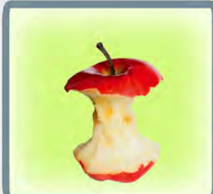
TABLE LEFTOVERS VEGETABLE MATTER OTHER FIBRES