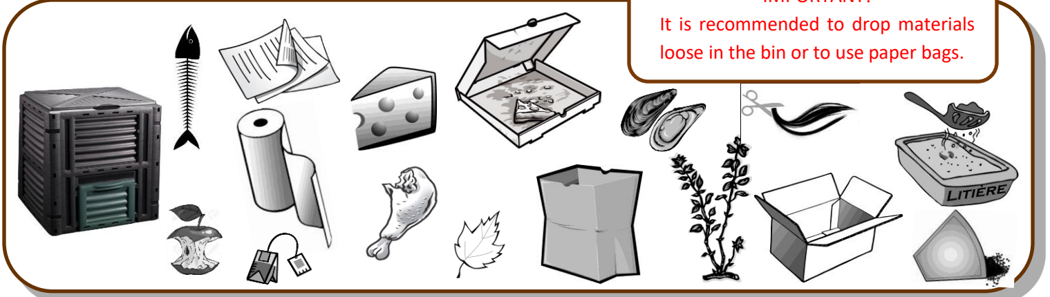
Table leftovers, plants, fibers

IMPORTANT! It is recommended to drop materials loose in the bin or to use paper bags.